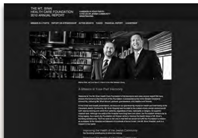
2010 Online Annual Report “Stewardship Letter” Page (Annual Report/Video designed by Epstein Design and Telos Productions)

For further information, contact the Foundation office at 216-421-5500 or visit the Foundation’s website at www.MtSinaiFoundation.org .