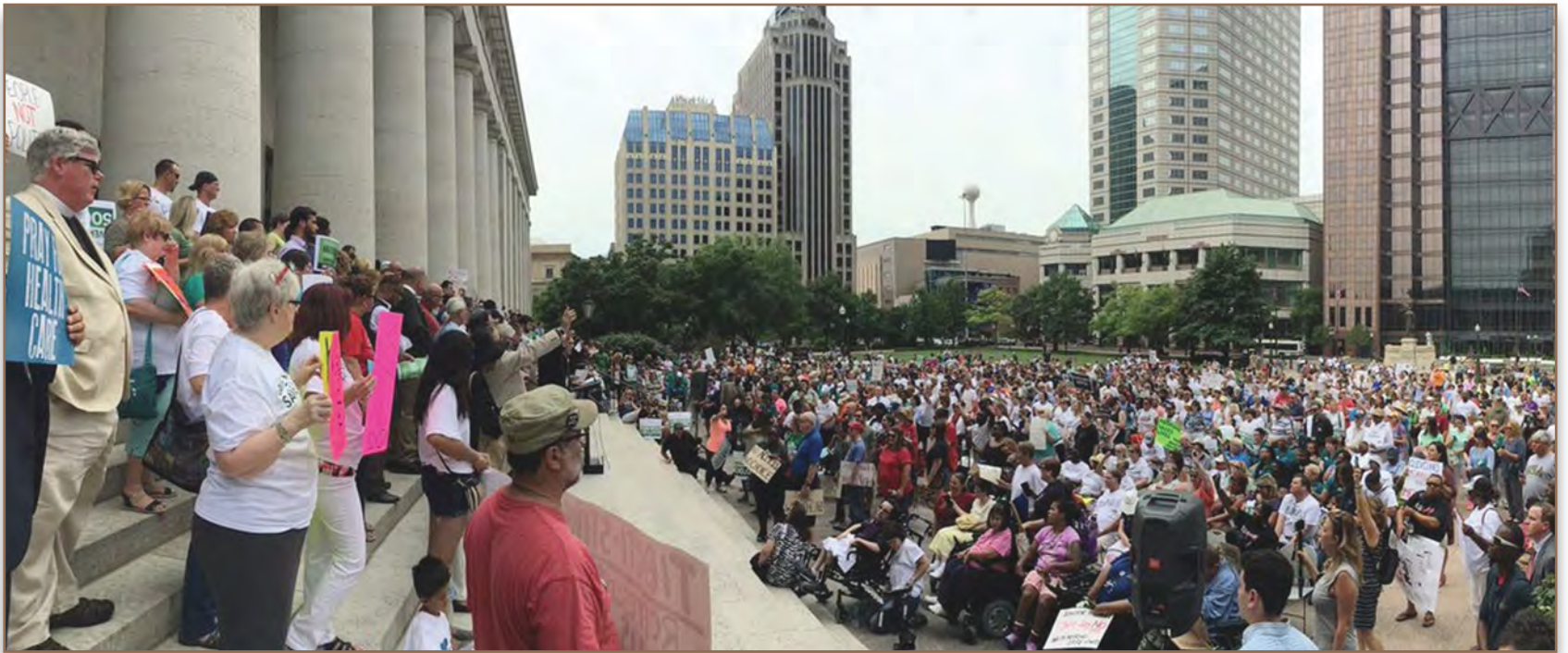
Rallying against the Medicaid Expansion veto override at the Ohio Statehouse in Columbus in June 2017.

This move would have crippled the program and potentially prevented hundreds of thousands of low-income people from receiving Medicaid health benefits. Governor Kasich vetoed this denial of services, but the Ohio General Assembly was intent on overriding the veto. Mt. Sinai joined the Universal Health Care Access Network (UHCAN) and Organize Ohio to fight the General Assembly by funding two buses that allowed dozens of Cleveland-area residents to attend a rally at the Statehouse in Columbus to demand the legislature to keep Medicaid Expansion. Although Ohio House leadership has indicated that legislators are still considering a vote to reinstate a freeze on Medicaid expansion enrollment, the first round of that fight has been won!